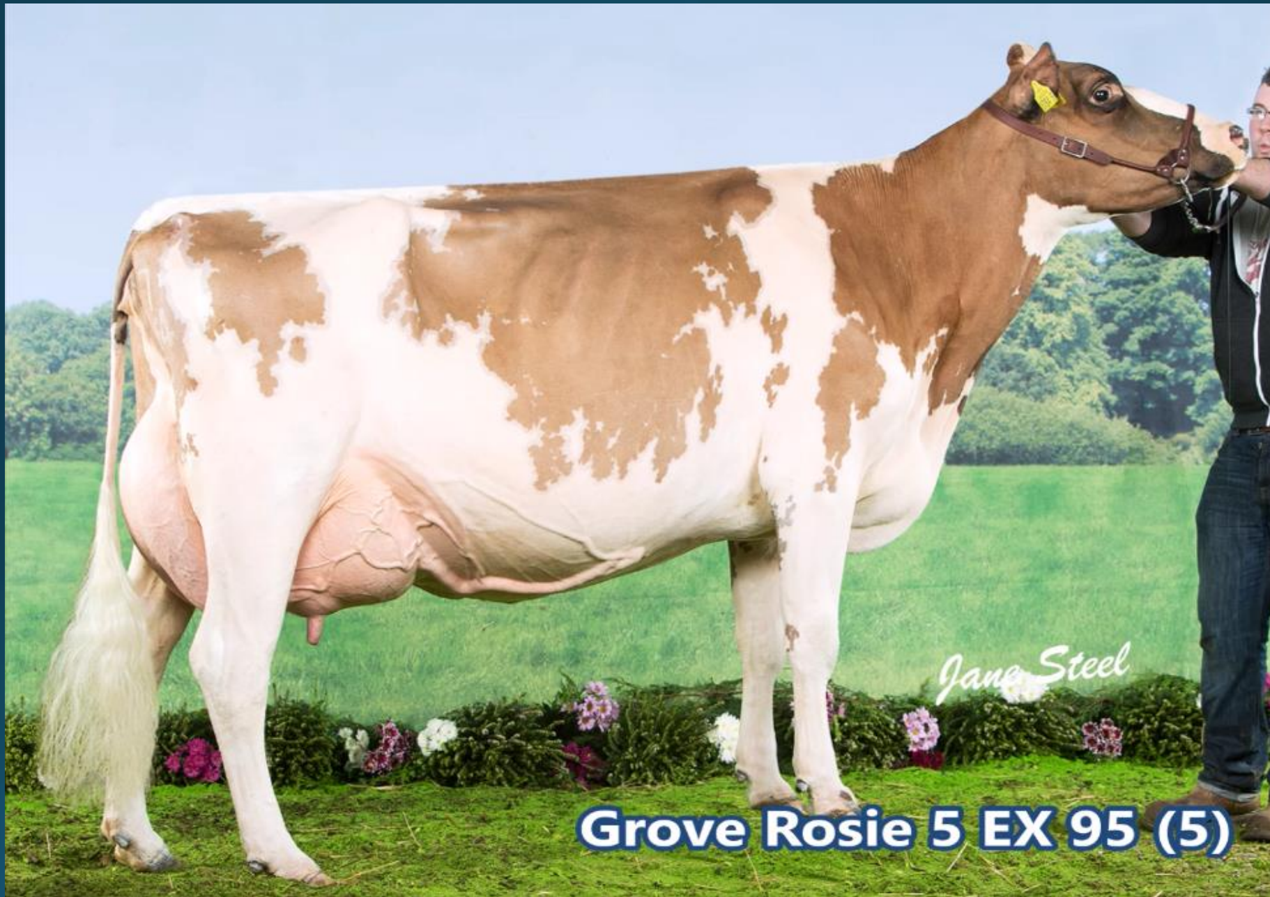
Grove Rosie 5 EX 95 (5)